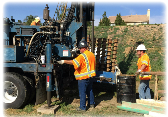
PBHSP PB-4 Well Drilling