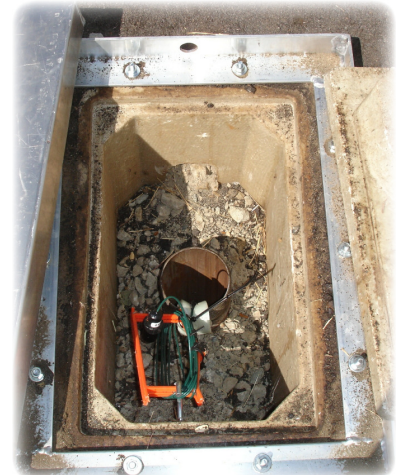
Monitoring Well with a Transducer

The current groundwater-level monitoring program is comprised of about 1,180 wells. At about 950 of these wells, water levels are measured by well owners, which include municipal water agencies, the California Department of Toxic Substances Control (DTSC), the Counties, and various private consulting firms. Watermaster collects these water level data at least semi-annually. At the remaining 230 wells, water levels are measured by Watermaster staff using manual methods once per month or by using pressure transducers that record data once every 15 minutes. These wells are mainly Agricultural Pool wells or dedicated monitoring wells located south of the 60 freeway.