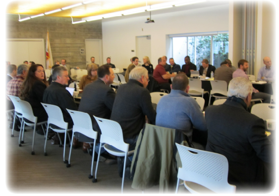
Safe Yield Recalculation Meeting

In 2011, Watermaster authorized Watermaster staff to compile the data necessary to recalculate Safe Yield and update its computer model of the Basin and based on the information developed from the data and the model to recalculate the Safe Yield. The model calibration was completed in 2012, and evaluation of the Safe Yield began in 2013. During the prior reporting period, the Watermaster Board advised the parties to enter into a facilitated process to develop an agreement to implement the recalculated Safe Yield. During this reporting period Watermaster parties met intensively in a facilitated process to develop an agreement regarding the implementation of the recalculated Safe Yield. Key principles of agreement were articulated during this reporting period, and drafting of the agreement continues into the next reporting period.