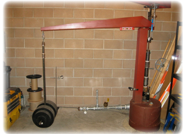
Land Subsidence Monitoring Equipment

In addition, the MZ-1 Plan states that if data from existing monitoring efforts in the so-called Areas of Subsidence Concern indicate the potential for adverse impacts due to subsidence, Watermaster will revise the MZ-1 Plan pursuant to the process outlined in Section 3 of the MZ-1 Plan. During this reporting period, Watermaster prepared a draft of the update to the MZ-1 Plan, which included a name change to the Chino Basin Subsidence Management Plan and a draft Work Plan to Develop the Subsidence Management Plan for the Northwest MZ-1 Area and an appendix.